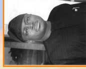
Rt. Hon. Edwards Daika, Representative of House of Parliament