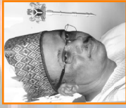
RT. Hon. Usman Bayero Nafada Deputy Speaker, House of Reps.