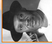
Mr. Elder Godsdan A. Orubebe Ex - Minister of State, Minister of Niger Delta Affair His Excl. Dr Olusegun Mimiko, Executive Governor of Ondo State