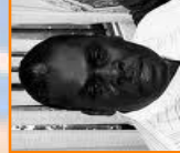
Hon. Igo Aguma, Representative of House of Parliament Chairman of House Committee on Oil & Gas